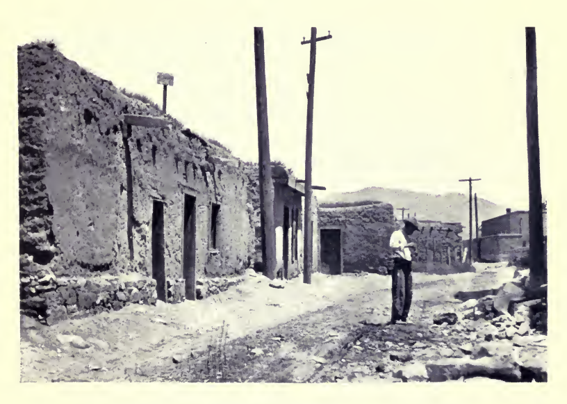
THE OLDEST HOUSE IN AMERICA, AT SANTA FÉ.