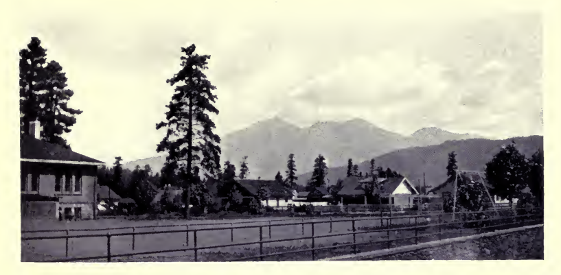
SAN FRANCISCO PEAKS FROM FLAGSTAFF.