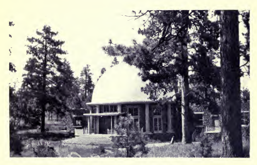
THE LOWELL OBSERVATORY, FLAGSTAFF.