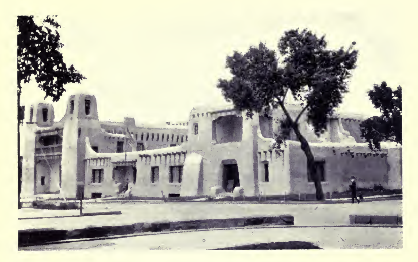
THE ART MUSEUM AT SANTA FÉ.