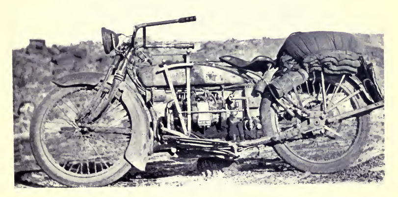
"LIZZIE" IN THE PETRIFIED FOREST, ARIZONA.