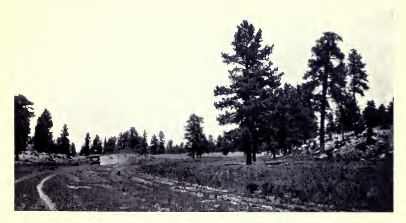
THE TRAIL TO THE GRAND CANYON.