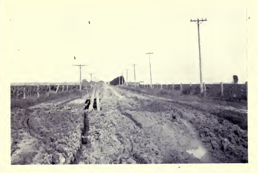
AN AWKWARD STRETCH OF ROAD IN INDIANA.